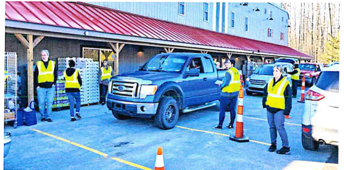
Patron cars line up for much needed food at recent food distribution.

A grant provided by the Midland Area Community Foundation allowed for the necessary updates needed at the Depot to get underway. Each of these projects is just one piece of the puzzle. When complete, that puzzle will look a lot like a store providing needed food and goods for the community. WMFC has also submitted a grant to the State of Michigan to provide other necessary pieces to move the progress of the new Depot along and complete the puzzle.