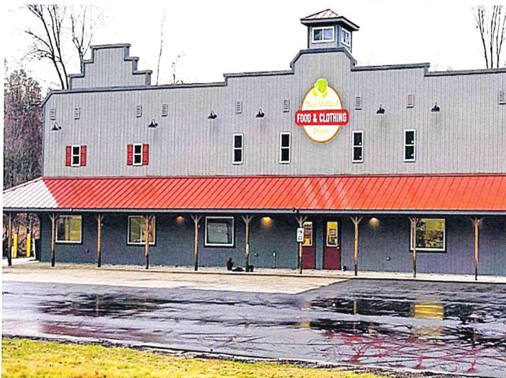
Super imposed signage on the new West Midland Food and Clothing Depot which is located two miles west of WMFC on M-20.

According to the State Science & Technology Institute (SSTI) , today almost 40% of American adults report that they are struggling to make ends meet each month. This is an increase from 34.4% in 2022 and 26.7% in 2021. As a result of ever-increasing prices across the economy, the need throughout the WMFC community has reached unprecedented levels. These facts made it necessary for WMFC to find new ways to help families make ends meet.