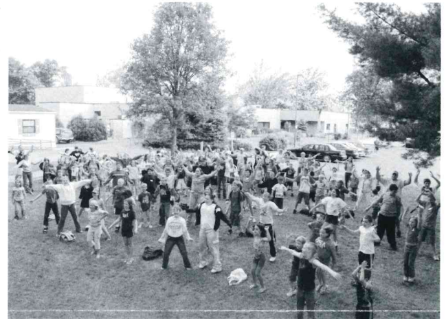
Each morning participants engage in stretching exercises.

For them, there are a multitude of activities each day including crafts, recreation, fitness focus groups, team fitness competitions,