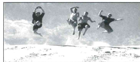
COP students "cut loose" at Sleeping Bear Sand Dunes.