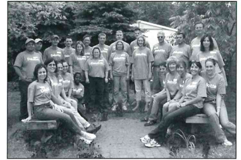
Deloitte staff members make a difference at WMFC.

As a rule, non-profit organizations have limited financial and human resources. This fact can limit their ability such that only the essential