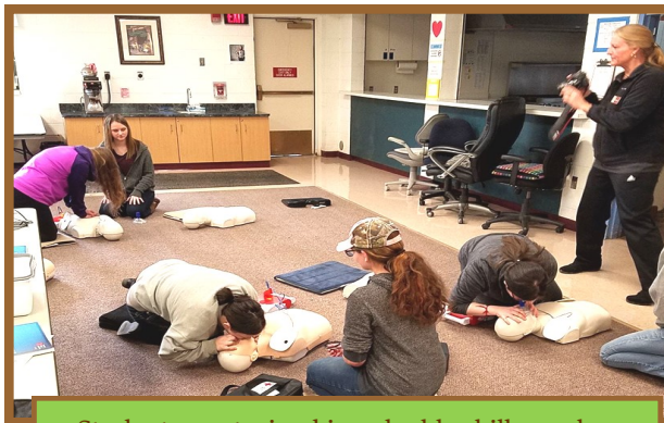
Students are trained in valuable skills, such as CPR, AED, and First Aid

[Dow COP] built me a better character than what I had before. If it wasn't for the pro- gram, I would not be in college at all. It helped clear out a foggy path for me to understand.