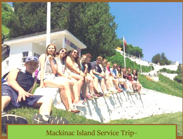
Mackinac Island Service Trip— Students help the community and explore the island!