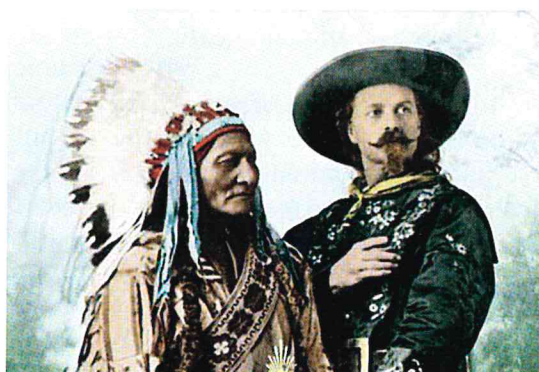
Sitting Bull and William "Buffalo Bill" Cody