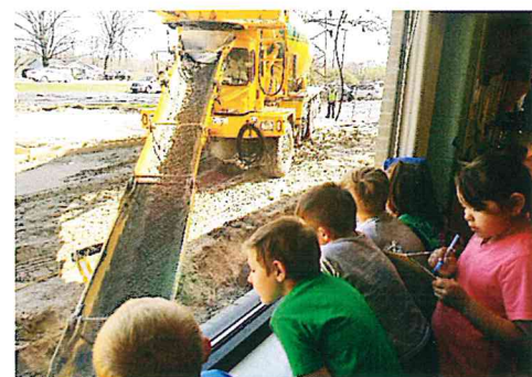
The preschoolers see all the ongoing activity as an exciting giant sized sandbox complete with a big yellow cement truck!