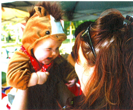
WMFC sponsored a Western Photo Opp. Families dressed up in western wear for family photos. That smile says it all!

It was a beautiful day along the shores of Sanford Lake Park...clear blue skies and warm temperatures. It was the perfect kind of day to have a picnic