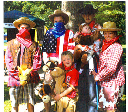
At the WMFC Parkapalooza Booth, families had a great time dressing up for family portraits!