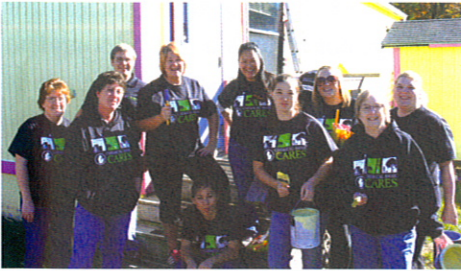
Thank you Chemical Bank volunteers for caring!

NONPROFIT U.S. POSTAGE PAID MIDLAND, MI PERMIT NO. 153