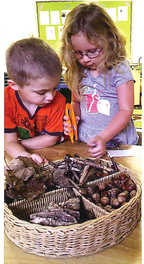
Children bring items inside to stack, count, sort, organize and classify.

with all of their senses, experiment in the environment, and communicate their discoveries to those around them.” WMFC preschool will continue to bring nature into the classroom and the classroom into nature in the years ahead.