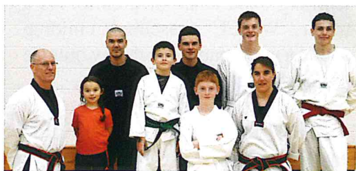
Gateway Martial Arts Instructors and Students

All Gateway Instructors are part of the communities in which they teach. They believe that volunteering in their community gives them an opportunity to invest in others and