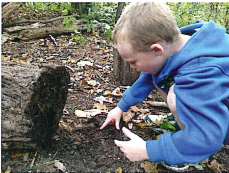
The great outdoors is a living classroom in which children can explore and learn at their own pace.

teepee in the middle of the WMFC “woods” helps stimulate the children’s imagination and creativity.