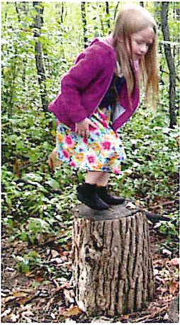
Playing outside helps children to improve their balance and coordination.

open wooded spaces in which children can explore and play. The trails and fallen trees throughout the WMFC properties lend themselves to the practice of physical skills, such as balancing, running, leaping, and jumping. A