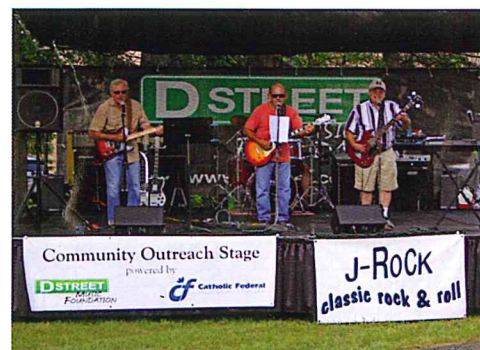
J-Rock performed classic rock hits as part of D-Street Music Foundation's continuing outreach at the Best of the West Celebration.