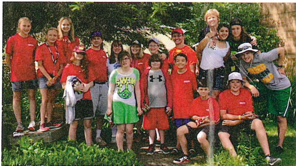
The First United Methodist Bible School was just one of many groups that volunteered at WMFC during the summer of 2016.