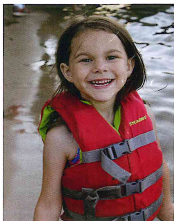
Taking a break from swimming and all the fun at WMFC Family Camp at Neyati.