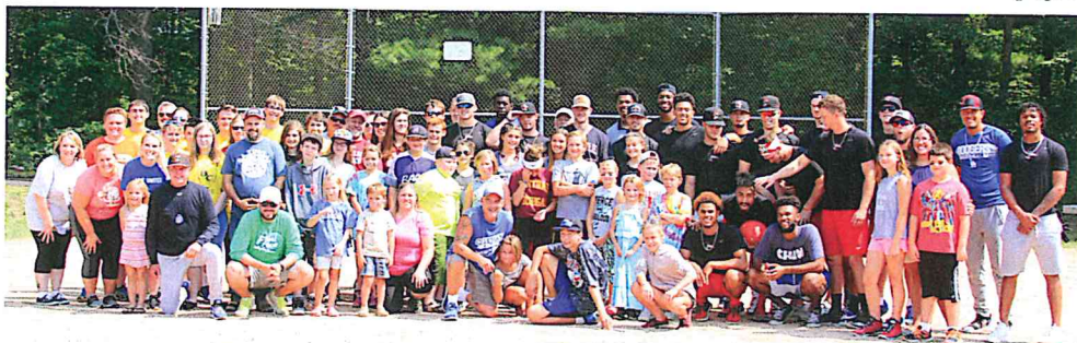
Great Lakes Loons demonstrate compassion at WMFC.