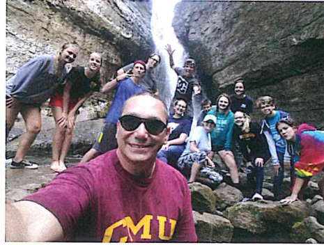
COP Students take a selfie at Miners Falls as a reminder to always follow through and pursue ones goals, even if it means having to overcome roadblocks along the way.

back tracking towards our goal and eventually we found the detour," continued Sobolewski. "Hiking out to the falls was great, but exploring behind and around the waterfall made the trip an unforgettable experience! Students learned first-hand that giving up is a sure way to lose out on opportunities, and that there is always another way to achieve your goal!"