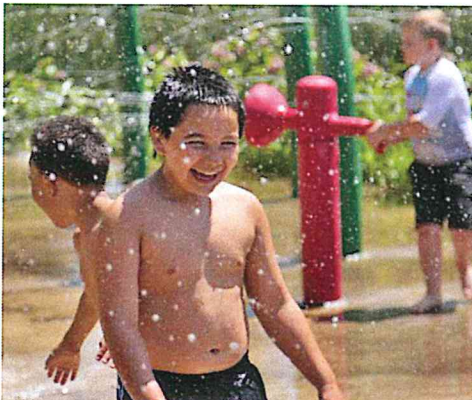
WMFC camper spends time with new camper friends playing in the Spring Hill Spray Park.