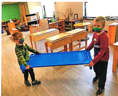
Preschool children help one another put away cots after rest time. Everything that is important in life is practiced in preschool.