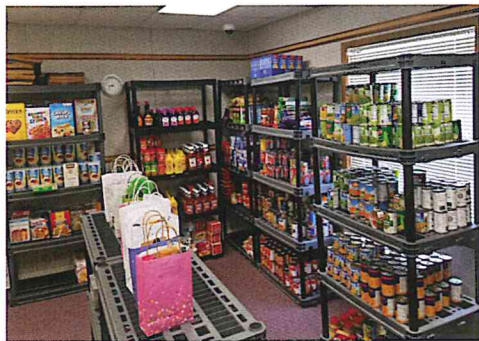
WMFC works with the Midland County Emergency Food Pantry Network to help feed hundreds of families throughout the year.

The WMFC Community Clothing Room will now share the "cottage." As a result of the change, the food pantry has tripled in size from what it was previously. The additional