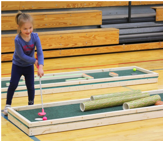
Miniature golf available with large games.

These are typical building hours that are subject to change. Please call ahead.