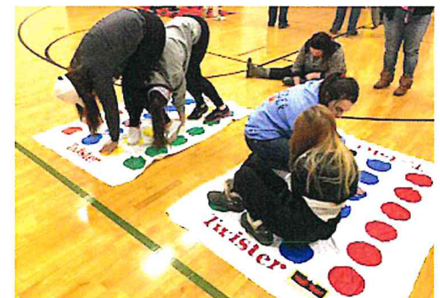
Family members entangle in a friendly game of Twister during a recent Recreation Family Night