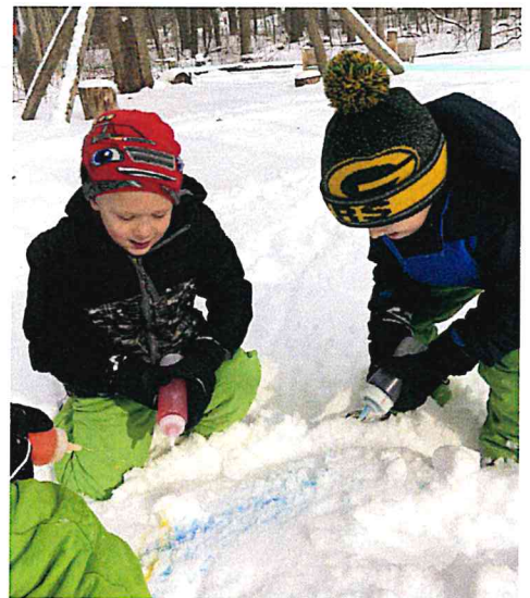
A quality preschool experience gives young children the opportunity to develop the socio-emotional skills needed for Kindergarten